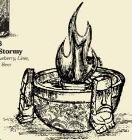
55 Cancun Campfire Choose the spirit for the tropical base