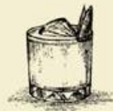
18 Ginloima Gin, Peach, Grapefruit, Lime