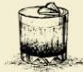
19 Burnt Pineapple Daiquiri Pineapple, Rum, Mezcal, Lime