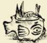
19 Sunset Dance Reposado, Honey Tequila, Orange, Lime, Ginger Ale